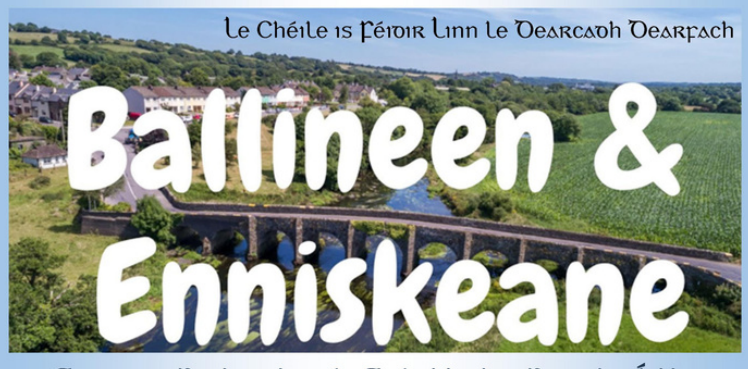
Smaoince Corbarcha dár Sráidbhailce Nasccha Áille